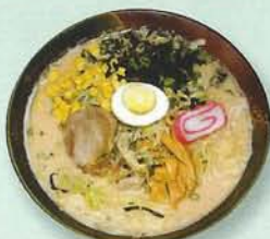
SUPER BOWL RAMEN $9.75