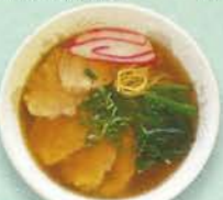
CHARSIU RAMEN OR UDON $8.00