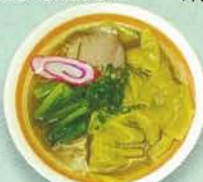
WONTON RAMEN OR UDON $8.00