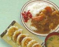
CURRY TEISHOKU $8.50