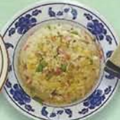
MINI PORK FRIED RICE