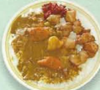
MOCHIKO CHICKEN CURRY $8.00 MOCHIKO CHICKEN PLATE $8.00