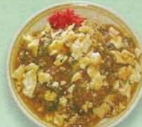
MAPO TOFU: $8.00 •FRIED NOODLE •CRISPY NOODLE •RICE