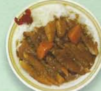
FISH KATSU CURRY RICE $8.50 FISH KATSU PLATE $8.50