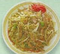
CHICKEN FRIED NOODLE $8.00 SHRIMP FRIED NOODLE $9.00