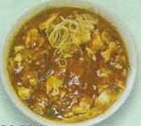
MAPO TOFU RAMEN OR UDON $8.00