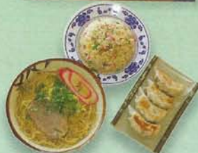
MISO COMBO GYOZA & FRIED RICE $9.50