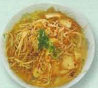
KIM CHEE RAMEN OR UDON $8.00