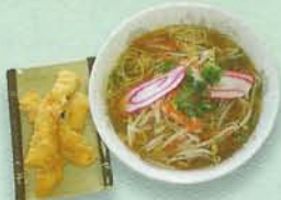
SHRIMP KATSU RAMEN OR UDON $8.50