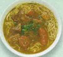
BEEF CURRY RAMEN OR UDON $8.50 CURRY RAMEN OR UDON $7.75