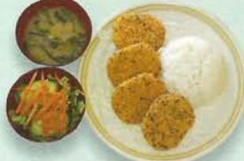
CROQUETTE CURRY RICE $8.00 CROQUETTE PLATE $8.00