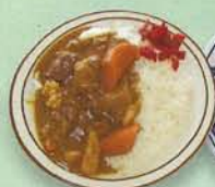
MINI CURRY RICE