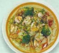
SHRIMP (OR SPICY) RAMEN OR UDON $9.00