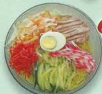
HIYASHI RAMEN $8.25