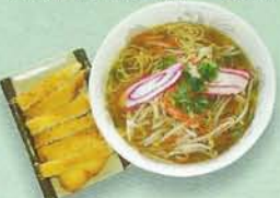
CHICKEN KATSU RAMEN OR UDON $8.25