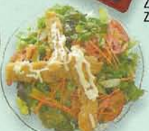
SHRIMP KATSU SALAD $6.75 With Special House Dressing