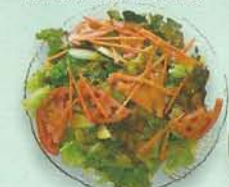
GREEN SALAD $5.25 With Special House Dressing