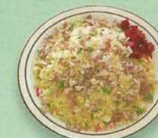
PORK FRIED RICE $8.00 CHICKEN FRIED RICE $8.00