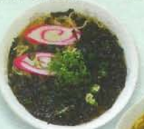
WAKAME RAMEN OR UDON $7.50