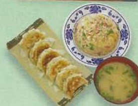
GYOZA TEISHOKU $8.00