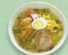
GOMOKU RAMEN GOMOKU UDON $8.50