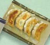
4 PCS GYOZA