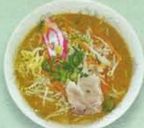
MISO, SHOYU, SHIO RAMEN OR UDON $7.50