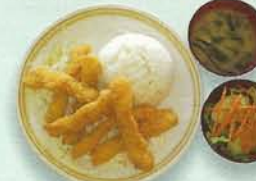
SHRIMP KATSU CURRY RICE $8.50 SHRIMP KATSU PLATE $8.50

ORDER ANY ITEM ABOVE WITH DEEP-FRIED GYOZA (4 PCS) $3.00 (6 PCS) $4.50