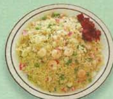
SHRIMP FRIED RICE $8.50 KIM CHEE FRIED RICE $8.50